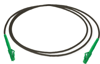
Fiber Optic Indoor/outdoor 3 mm Drop Cable Assembly, LC/APC-LC/APC, 40 M