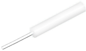
LazrSPEED® 900µm Tight Buffered Fiber