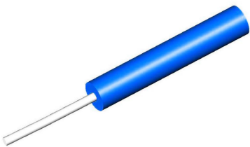
LazrSPEED® 900µm Tight Buffered Fiber