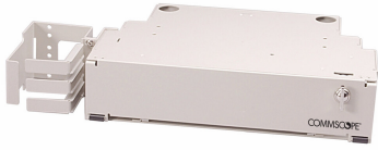
FL2000 Fiber Termination Panel, 12 SC/UPC, singlemode, 2RU, 19 in, putty white