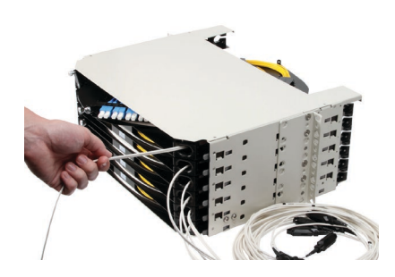
RapidReel Fiber Cable Spool Accelerates Fiber Installation

With the new Rapid fiber panel, the IFC cable is mounted inside the panel on a RapidReel spool, which means the panel features built-in slack storage as well. With up to 100 feet of IFC cable available on the Rapid fiber panel, installers can simply pay out the precise length they need from the internal spool; they no longer have to pay for and store excess cable nor engineer upfront the precise cable length they need.