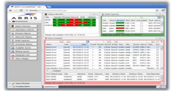
AdManager Enterprise Dashboard: Operatorwide, consolidated management and reporting.