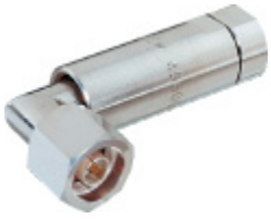
Type N Male Right Angle for 1/2 in cable