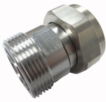
7-16 DIN Male to 7-16 DIN Female Low-PIM Adapter