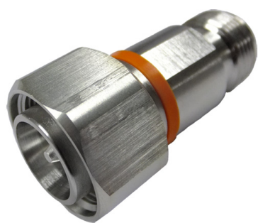
N Female to 4.3-10 Male Low-PIM Adapter