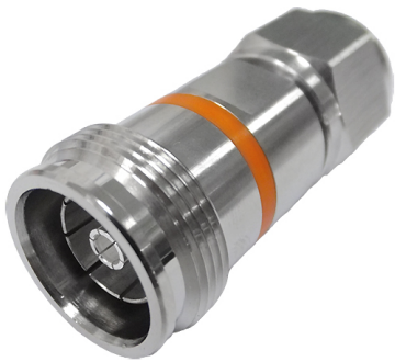
N Male to 4.3-10 Female Low-PIM Adapter