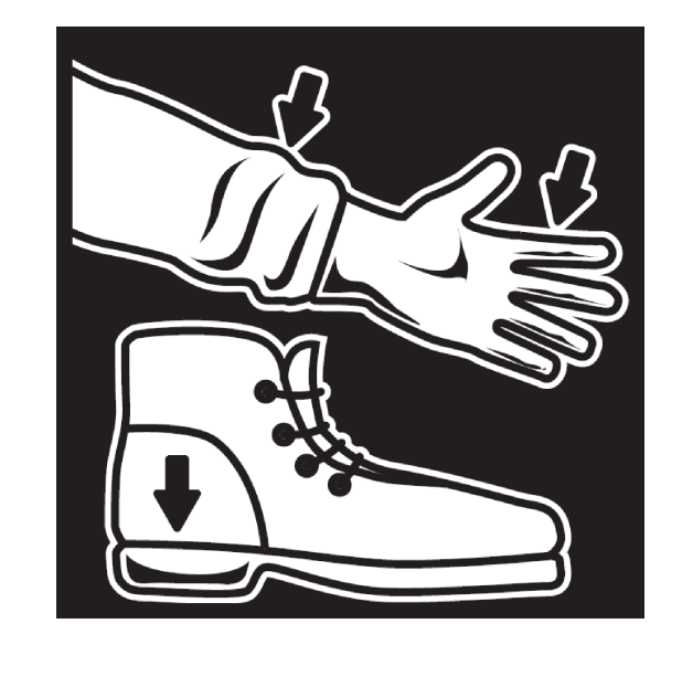
Wear shoes with rubber soles and heels. Wear protective clothing including a long-sleeved shirt and rubber gloves.