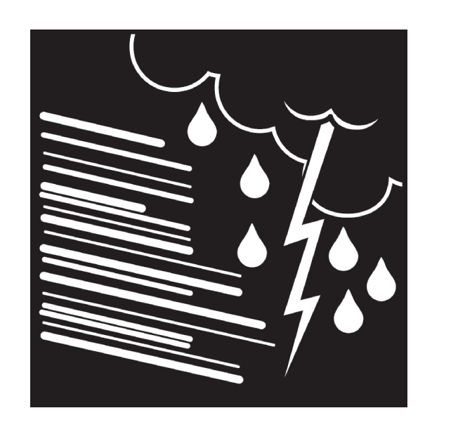
Do not install on a wet or windy day or when lightning or thunder is in the area. Do not use metal ladder.