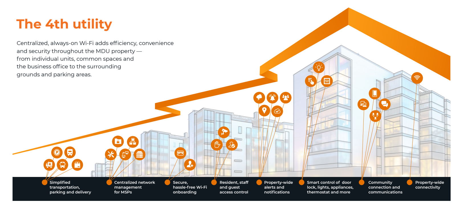
MANAGED SERVICE PROVIDERS