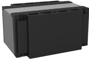
TENIO™ Cable Gel Seal kit, dummy, no cable outlets, black