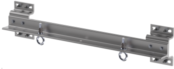
Cable Support Mount for Guyed Towers to Support Cable, 41 or 42" Face

The 860674607-041-42 is a purpose built tower face bracket that is designed to support 1000 pounds of cable per eye up to 2000 pounds in combination. Ideal for Hybrid cable. Includes mounting eye bolt for attachment.