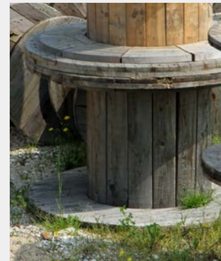
Discolored wood that is undamaged is acceptable.